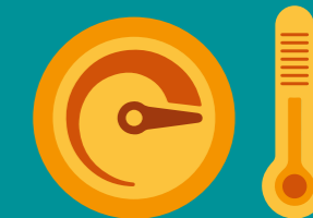
Metering, monitoring, targeting