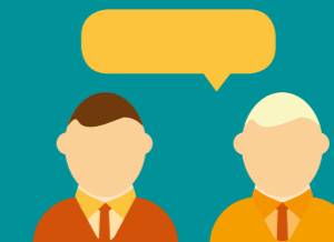
Behavioural change programmes