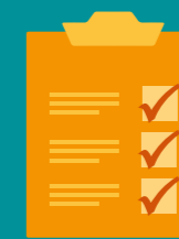
Compliance inc. ESOS