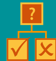
Technical project development