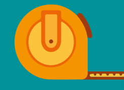
Measurement and verification